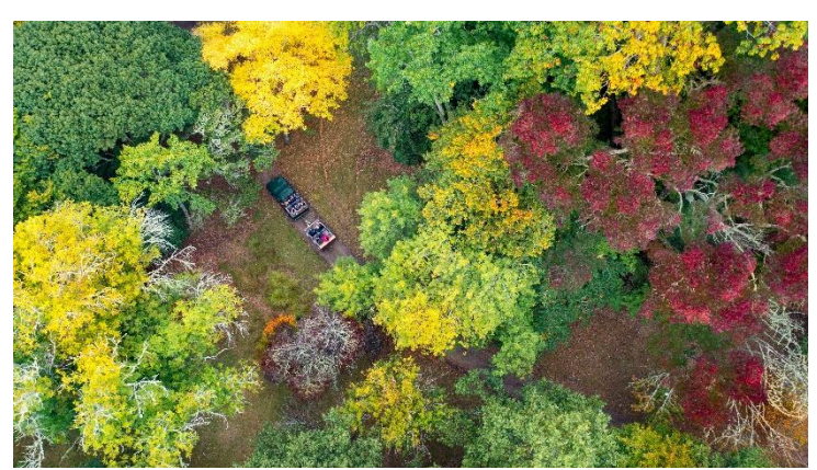
Eastwood Hill National Arboretum